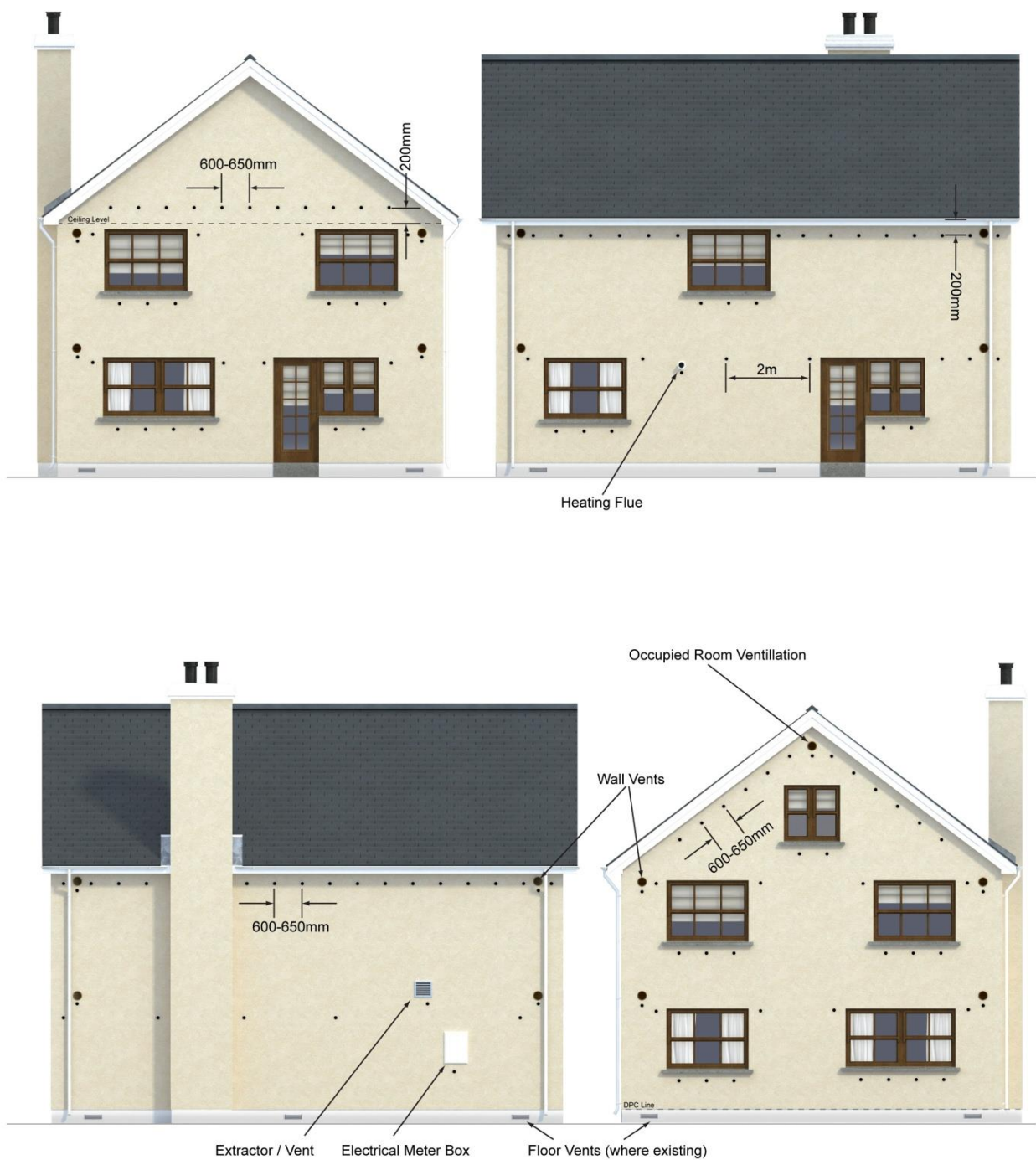
Figure 1: Typical Thermobead Hole Drilling Pattern in a Detached Dwelling. New and existing buildings without existing partial fill insulation in cavity.